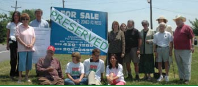
Partners celebrate preservation of the Drake Farm – June 2007