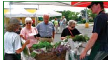
Montgomery Friends Farmers Market

Please join us in preserving Montgomery Township's open space by filling out and mailing the membership form in this brochure. Please be sure to include your e-mail address.